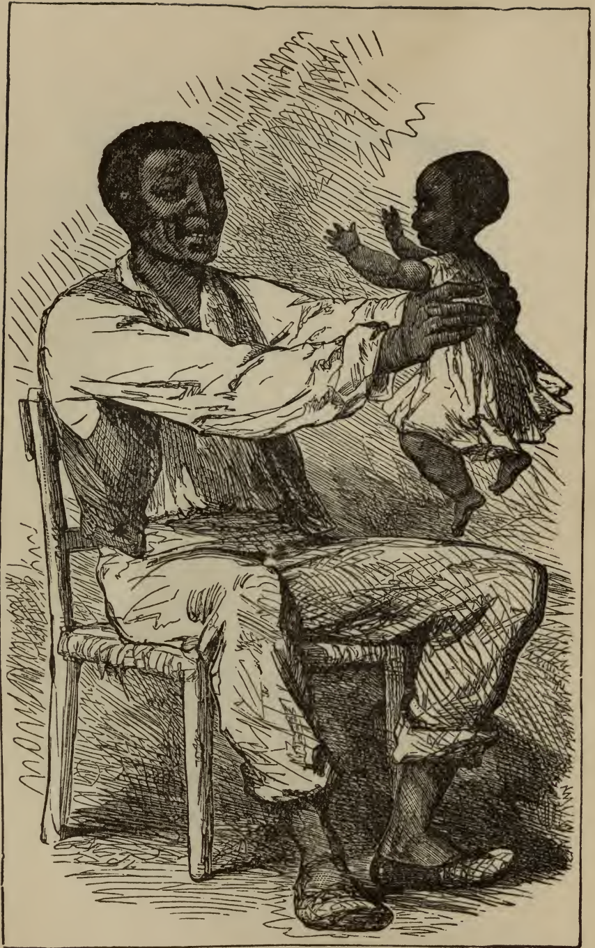
"An't she a peart young un?" said Tom, holding her from him to take a full-length view." — Page 29.